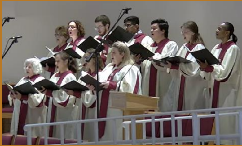
The Mother Seton Choir

Mass of Thanksgiving and Appreciation for donations to the 2021 Annual Appeal and the Ave Maria Legacy from Jesus the Good Shepherd Catholic Church in Owings, MD, September 9, 2021