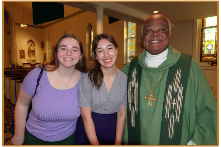
St. Mary's Church & Shrine of Our Lady of Fatima in Barnesville, MD on August 1 st