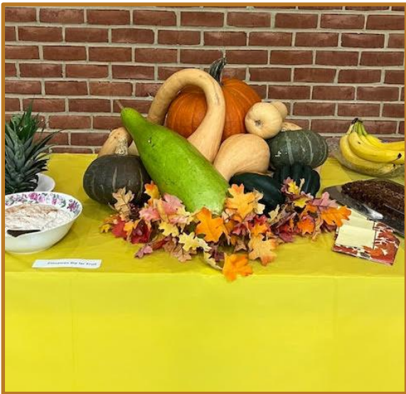
The day started with breakfast!