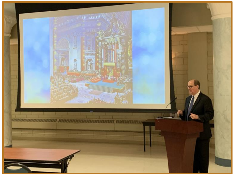
Slides depicting the Vatican II Council.