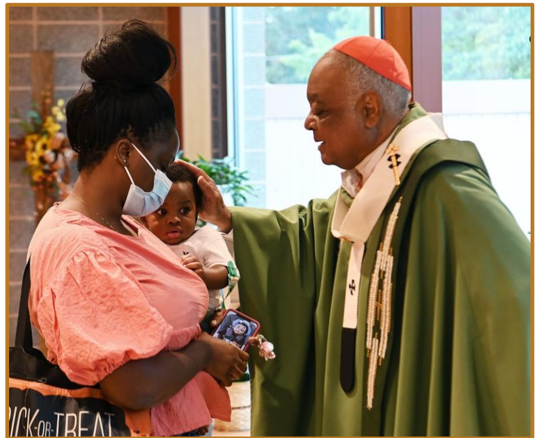
Saint Rose September 5, 2021, to bless the Prayer Room, the Evangelists and Our Lady of Guadalupe