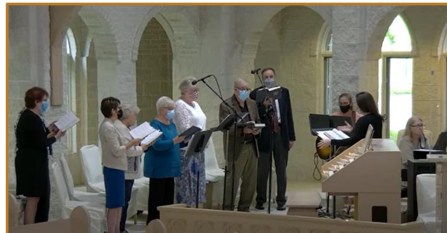
The Jesus the Good Shepherd Choir