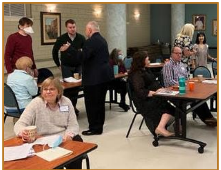
NPM Members gathering in person.